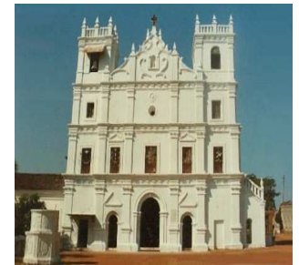
St Thomas Church - Aldona